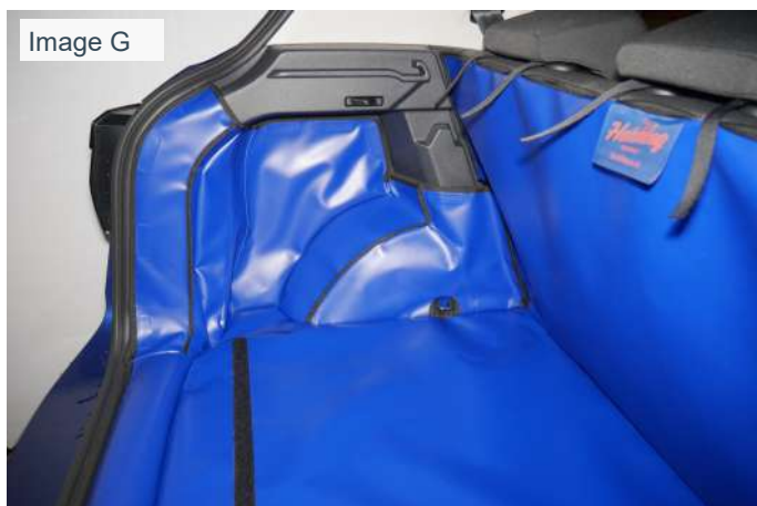
FRSD - left side - Rear Plus boot liner prepped for a bumper flap (with front "D-ring" access option)