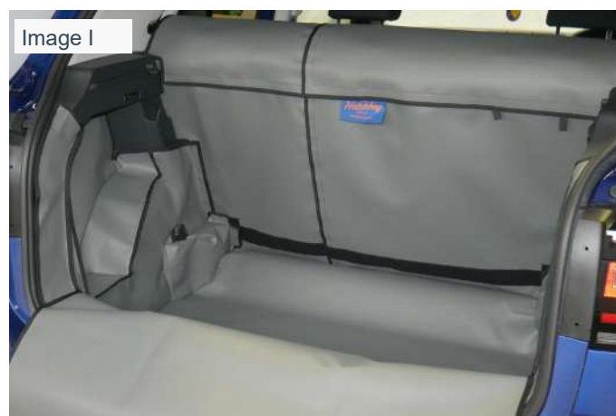
FLOW - left side - Rear Plus with Seat Splitboot liner, seat flap and bumper flap (prepared for a Bootliner Extension, and with front "D-ring" access option)