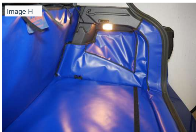
FRSD - right side - Rear Plus boot liner prepped for a bumper flap (with front "D-ring" access option)