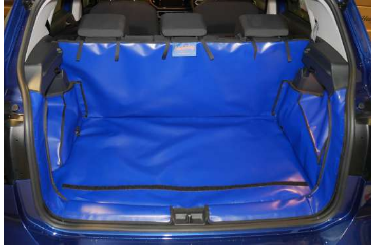
FRSD Rear Plus boot liner prepped for a bumper flap (with front "D-ring" access option)