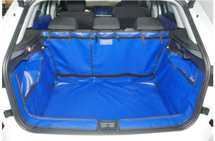
FNO: Split boot liner prepped for a seat flap, boot liner extension and bumper flap