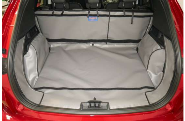
Split boot liner prepped for a boot liner extension, seat flap and bumper flap