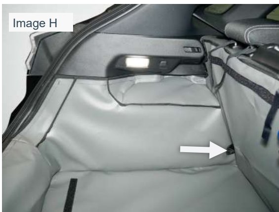
SH2 boot liner left side