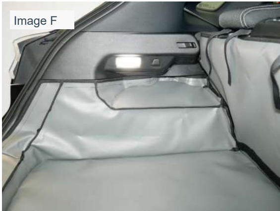
SH1 boot liner left side