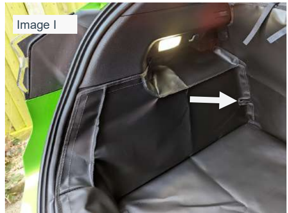
SH3 boot liner left side