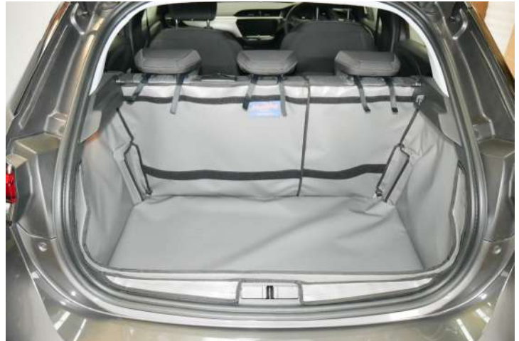
Split boot liner prepped for a seat flap and boot liner extension.