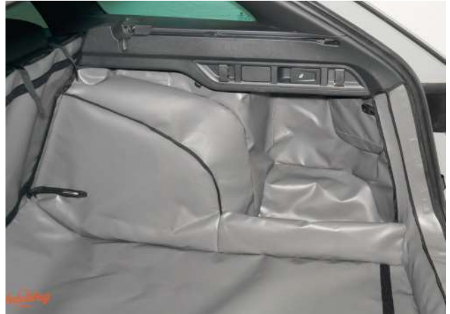
SH2- boot liner right side