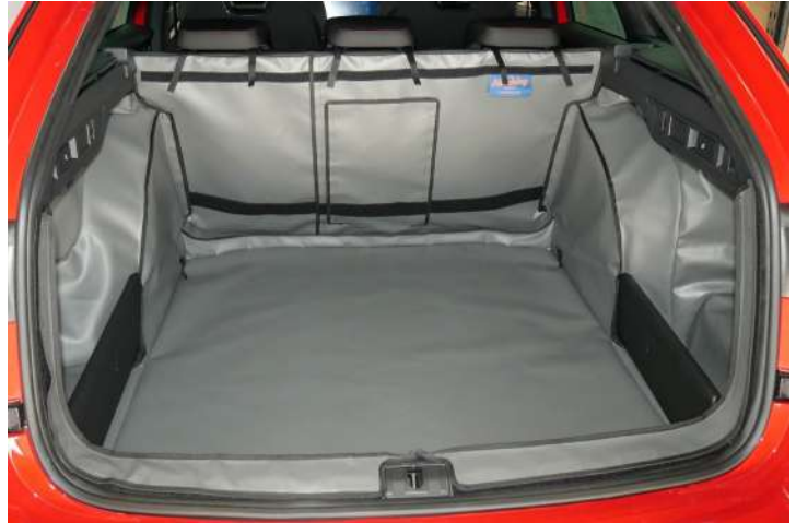
SH1- Rear Plus with Seat Split & Ski Flap boot liner prepped for a seat flap and bootliner extension