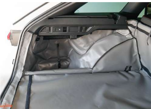
SH4- Hybrid- boot liner left side