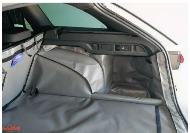
SH4- Hybrid- boot liner right side