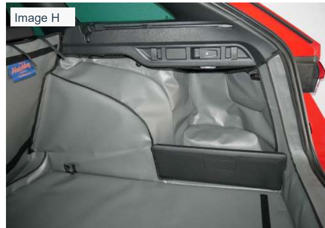
SH1- boot liner right side