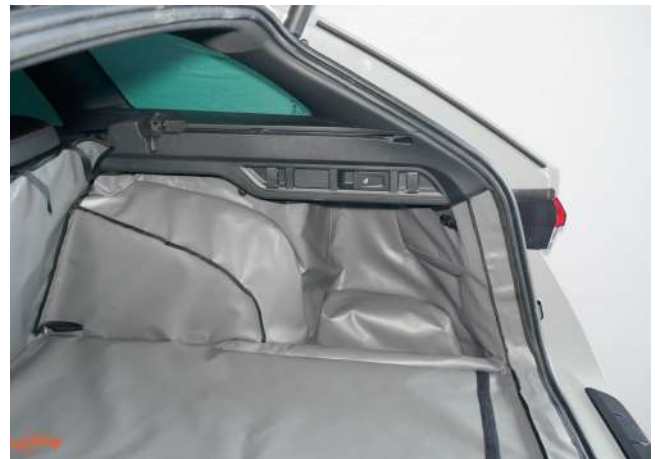
SH3- boot liner right side