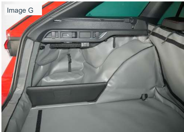
SH1- boot liner left side