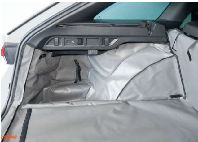
SH3- boot liner left side