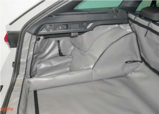
SH2- boot liner left side