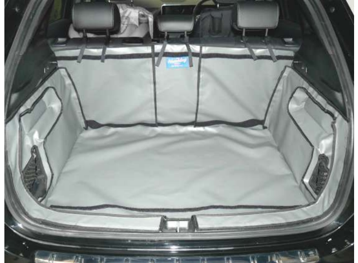
Split boot liner prepped for seat flap, boot liner extension and bumper flap