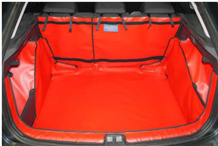
Rear Plus with Seat Split boot liner prepped for a seat flap, bootliner extension.