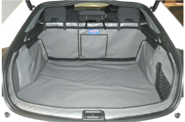
Rear Plus with Seat Split and Ski flap boot liner prepped for a seat flap & boot liner extension.