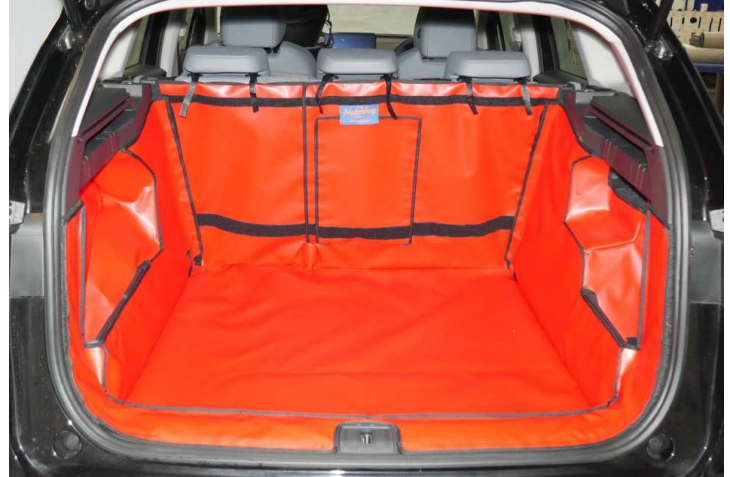
Rear Plus with Seat Split boot liner prepped for a seat flap, bootliner extension and bumper flap.