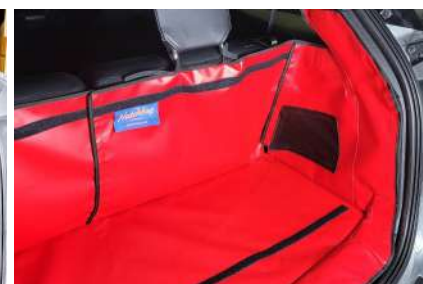
Image H - R3FLD - bootliner sides