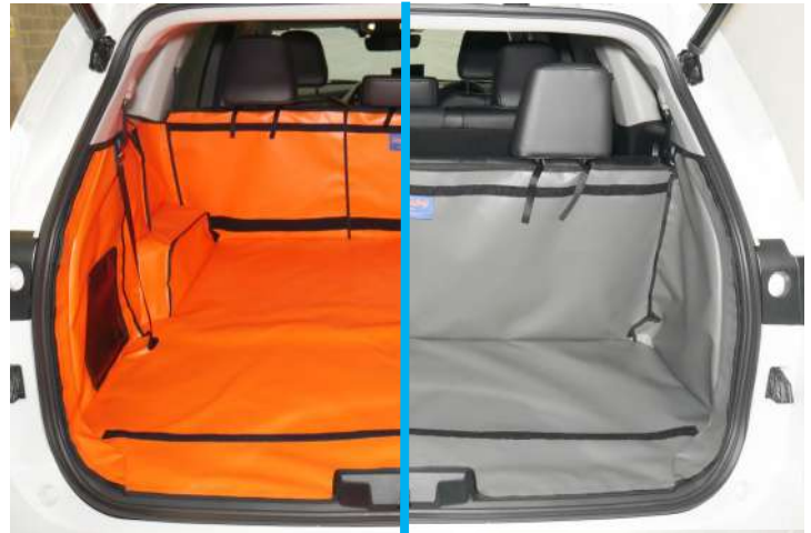
Left: R3FLD boot liner prepped for a seat flap, boot liner extension and bumper flap