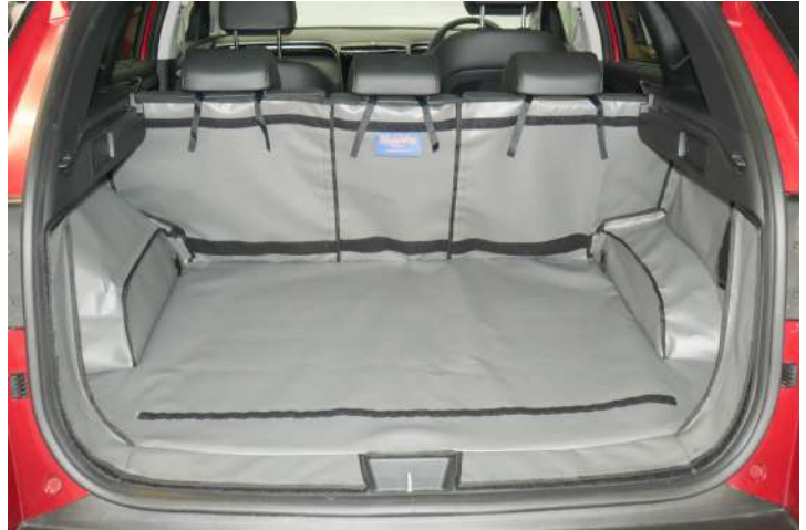
FRSD Rear Plus with Seat Split boot liner prepped for a seat flap, boot liner extension and bumper flap.