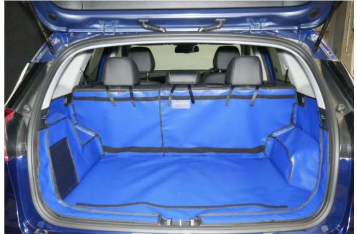
Rear Plus with Seat Split boot liner prepped for a seat flap, bootliner extension and bumper flap.