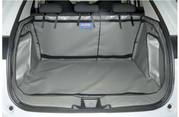
Rear Plus with Seat Split boot liner prepped for a seat flap, boot liner extension and bumper flap.