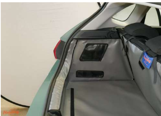
SH2-FRSD-SPK- left side