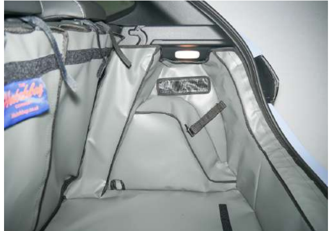
SH1- FNO - right side