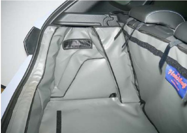
SH1-FNO - left side