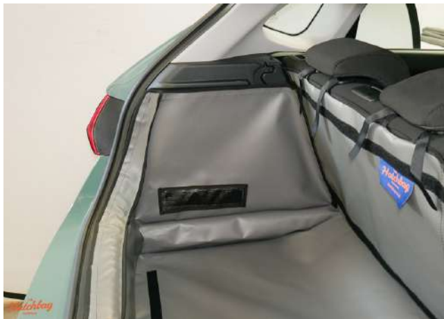
SH2-FLOW-SPKNO - left side