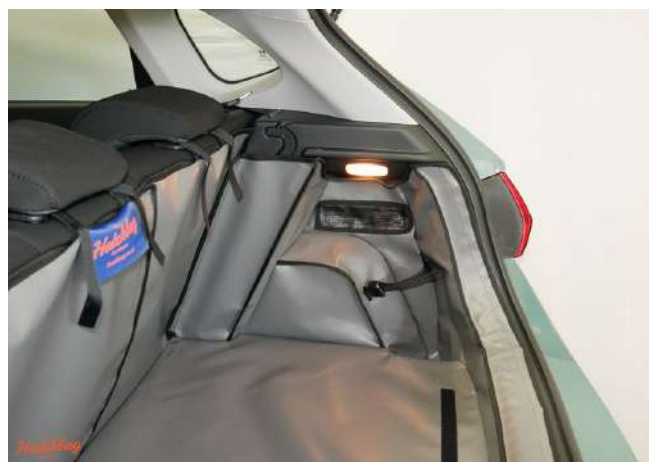
SH2-FRSD-SPK- right side