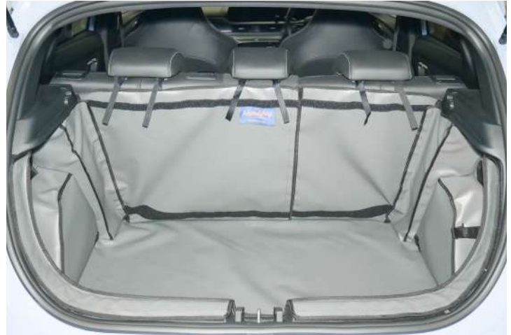
SH1– FNO- Rear Plus with Seat Split boot liner prepped for a seat flap, boot liner extension and bumper flap.