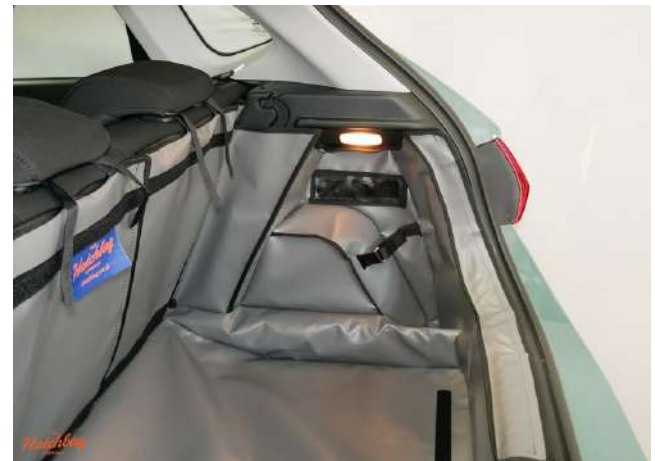
SH2- FLOW-SPKNO - right side