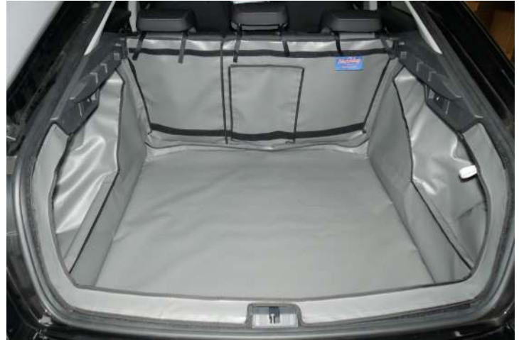
Rear Plus with Seat Split boot liner prepped for a seat flap, boot liner extension and bumper flap.