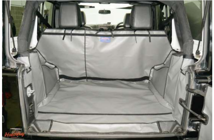
Rear Plus with Seat Split boot liner prepped for a seat flap, bootliner extension and bumper flap.