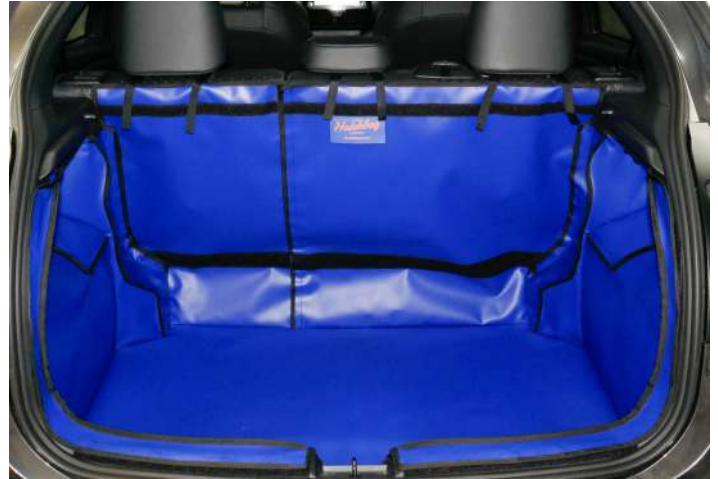
Rear Plus with Seat Split boot liner prepped for a seat flap, boot liner extension and bumper flap.