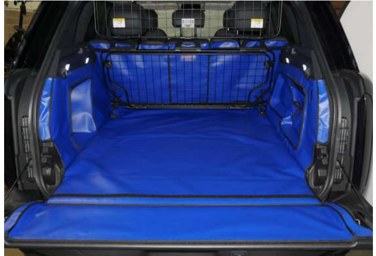
Rear Plus with Seat Split boot liner prepped for a seat flap, boot liner extension and bumper flap.