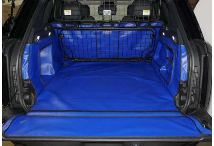
Rear Plus with Seat Split boot liner prepped for a seat flap, boot liner extension and bumper flap.