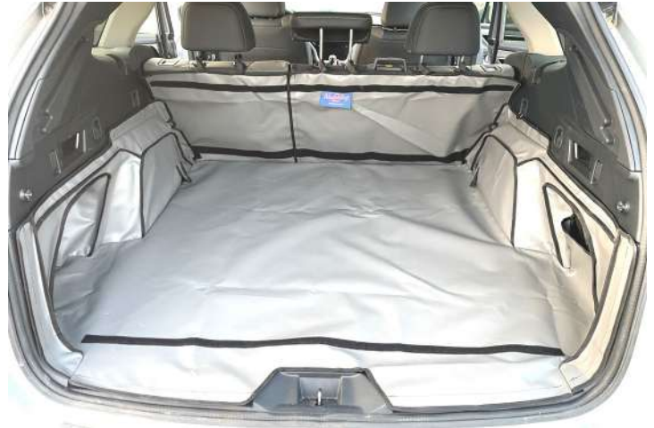
Rear Plus with Seat Split boot liner prepped for a seat flap, boot liner extension and bumper flap.