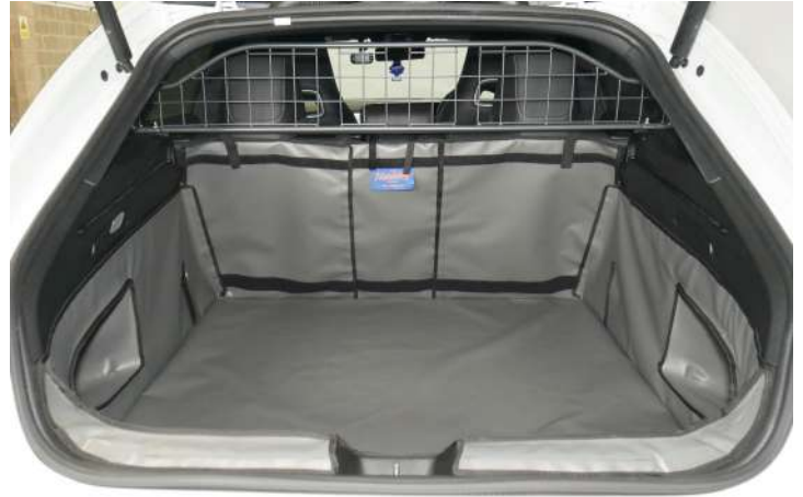
SH1-NETNO- Rear Plus with Seat Split boot liner prepped for a seat flap and bootliner extension.