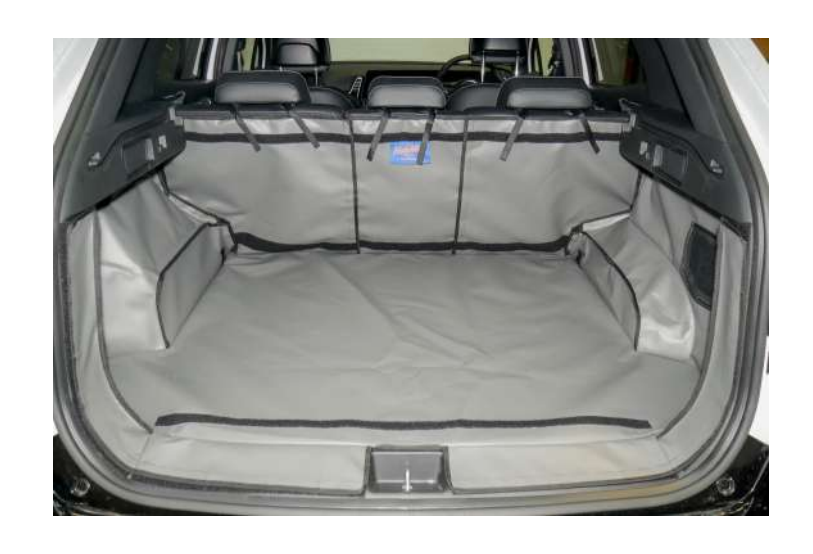
FRSD Rear Plus with Seat Split boot liner prepped for a seat flap, boot liner extension and bumper flap.