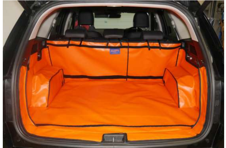
Rear Plus with Seat Split boot liner prepped for a seat flap, boot liner extension and bumper flap.