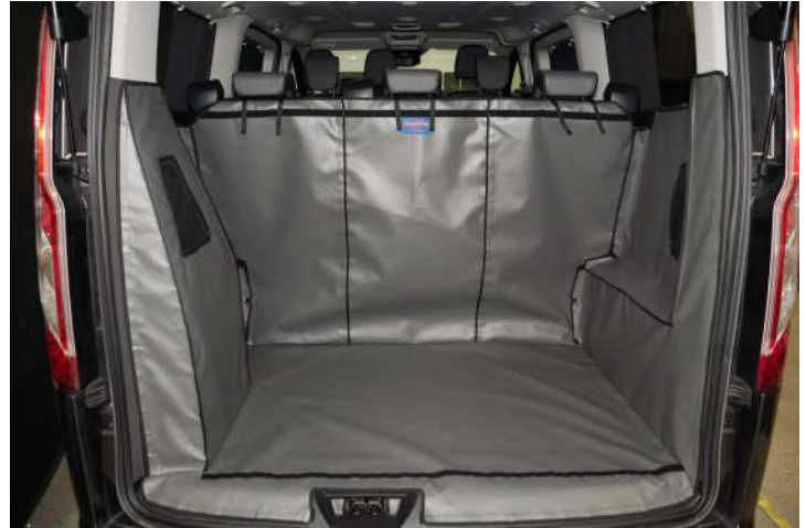
Rear Plus with Seat Split boot liner prepped for a seat flap and bumper flap.