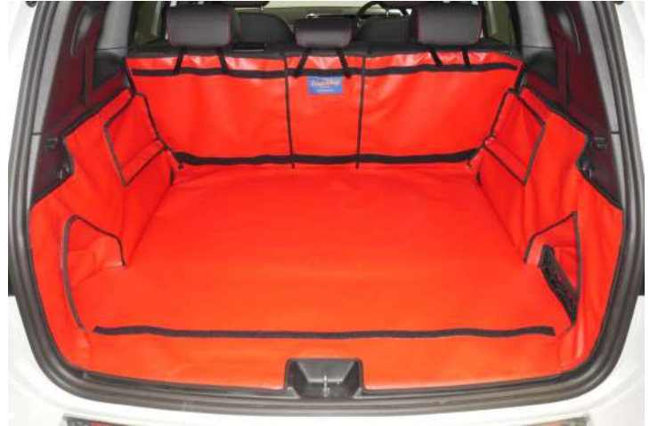
Rear Plus with Seat Split boot liner prepped for a seat flap, boot liner extension and bumper flap.