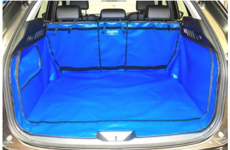
Rear Plus with Seat Split boot liner prepped for a seat flap, boot liner extension and bumper flap.