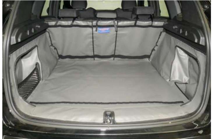
Rear Plus with Seat Split boot liner prepped for a seat flap, boot liner extension and bumper flap.