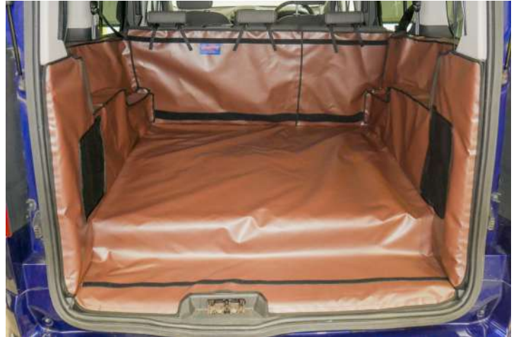
Rear Plus with Seat Split boot liner prepped for a seat flap, boot liner extension and bumper flap.