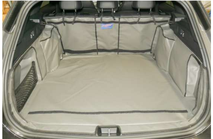
SH1: Rear Plus with Seat Split boot liner prepped for a seat flap, boot liner extension and bumper flap.