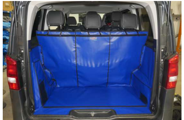
Rear Plus with Seat Split boot liner prepped for a seat flap and bumper flap.