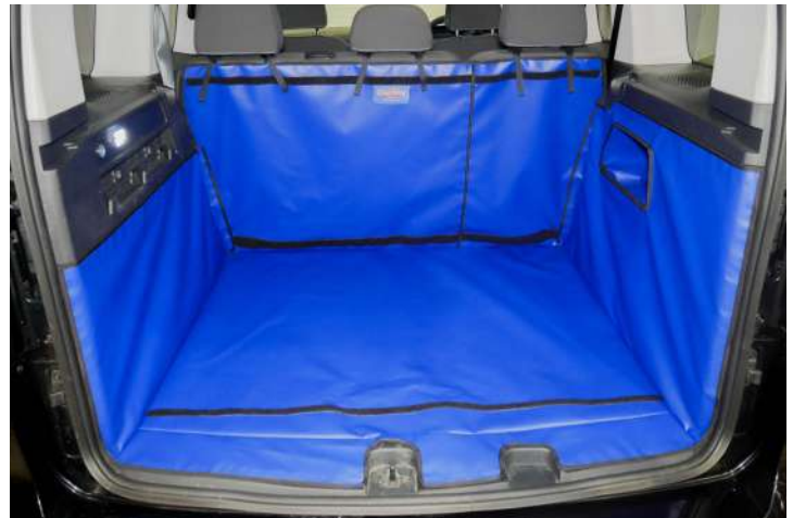
Rear Plus with Seat Split boot liner prepped for a seat flap, boot liner extension and bumper flap.