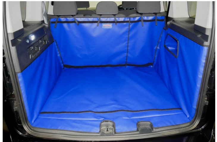
Rear Plus with Seat Split boot liner prepped for a seat flap, boot liner extension and bumper flap.