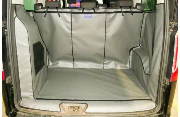
Rear Plus with Seat Split boot liner prepped for a seat flap and bumper flap.